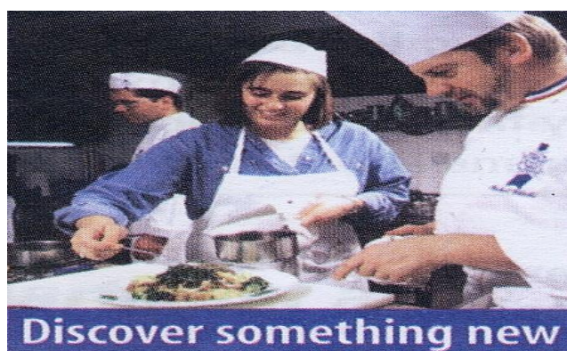
Figure 4: Interchange Student's Book 2 (Richards, 2005, p. 30).

As is shown in Figure 4, the frontal plane of the woman in this figure is parallel to the frontal plane of the viewer. She is, thus, depicted as someone who belongs to the viewer's world or someone with whom the viewer is involved. The male participants, however, are shown from an oblique angle. They are, thus, represented as others, as detached from the viewer. They are,