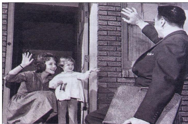
Figure 7: Interchange Student's Book 2 (Richards, 2005, p. 14).

The two female participants in Figure 7 are, on the one hand, separated from the man by the framelines formed by the right edge of the door and, on the other hand, they are represented as belonging to the context of home because they are positioned within the frame formed by the edges of the door and also the dark shade behind them. In fact, the edges of the door and the dark part within the frame of the door divide the picture into two parts: home and outside . The man is depicted as belonging to outside (activities) while the females are shown as belonging to home; these representations also seem to be stereotypical.