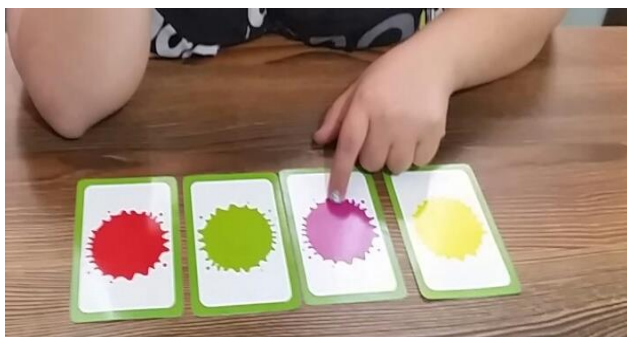
Figure 2, Flash cards

Considering her mental age (six years old) based on "Draw-a-Person tests", American First Friend 1 published by Oxford University Press was chosen. It is a phonemic program designed to develop letter recognition skill and letter formation. This book comprised of 10 units focusing on learning alphabets and vocabularies. Other material used along with the book were flashcards, Persian and English magnet alphabets and a magnet board. (Pictures 2 & 3).