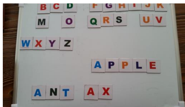
Picture 5, Making words with magnet letter based on sounds

She was presented with the word in printed form and her attention was directed to the most important phonemes of the word not irregularities. If there was silent letter, she was told not to read them. She was asked to identify initial sounds in words and engage in sound blending activities, letter sound