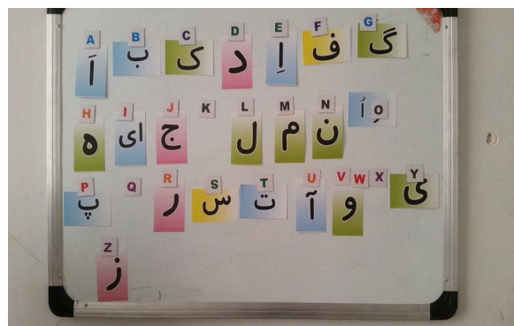
Picture 4, using Persian equivalent as mnemonic

After learning the letters and corresponding sounds, she was made to make the mono syllabic regular words using tactile, kinesthetic and visual senses (Picture 5). Based on MSL strategies Language concepts were taught in logical, sequential steps from simple to more complex tasks.