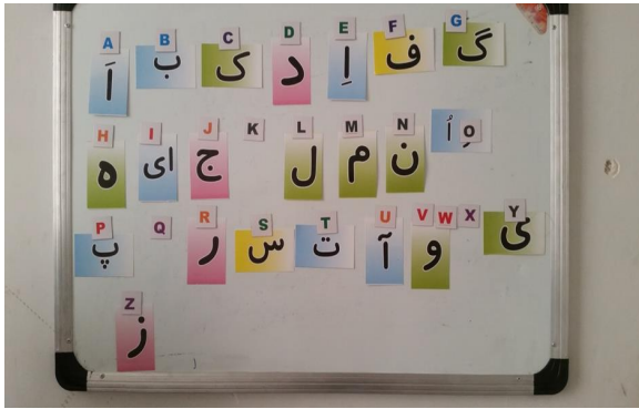
Picture 4, using Persian equivalent as mnemonic

After learning the letters and corresponding sounds, she was made to make the mono syllabic regular words using tactile, kinesthetic and visual senses (Picture 5). Based on MSL strategies Language concepts were taught in logical, sequential steps from simple to more complex tasks.