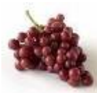
1 kilogram of grapes

Instructions: Your friend is going to the supermarket. Below is a list of TEN (10) things you need, in order to prepare dinner for you and your family. Use the phone to talk to her. Tell him/her in English what you need ( do not use Farsi to do this task ). If he/she does not understand what he/she has to buy, explain in English and use all of the details. You have 10 minutes to complete the task.