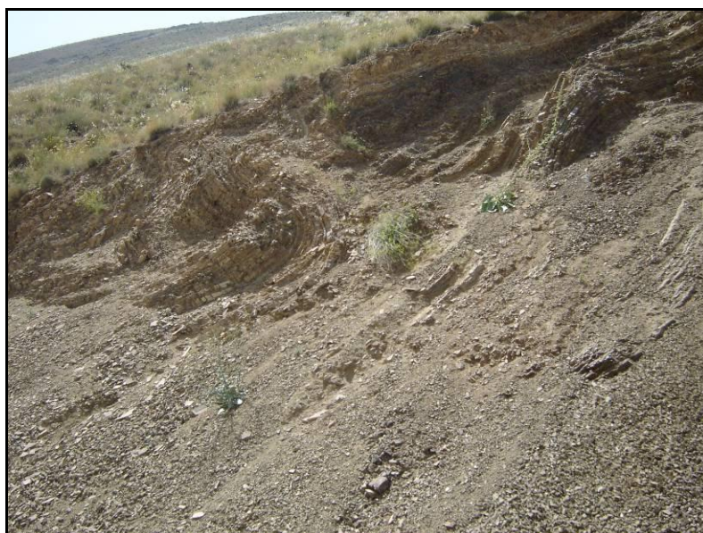
Fig.3 A part of Pourkan-Vardij fault zone

There are several faults in the tunnel route. The main fault zone and crushed zone is Pourkan-Vardij fault zone that cuts the tunnel route in 6417 to 6442 meter from end of the tunnel (Fig.3). It should be noted that CZ and FZ show crushed and fractured zones respectively due to fault activity.