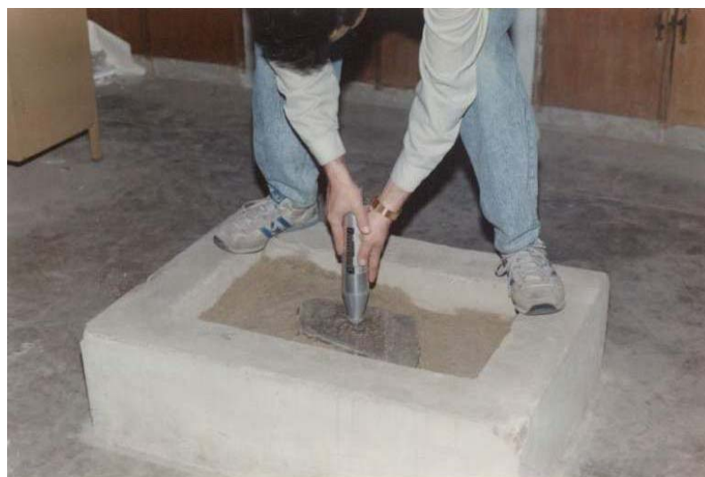
Fig. 1: Measurement of uniaxial compressive strength (JCS) by L-type Schmidt rebound hammer under saturated condition.

up to 30 cm. The samples were placed firmly in the fine sand to avoid sample movement during experiment (Fig.1).