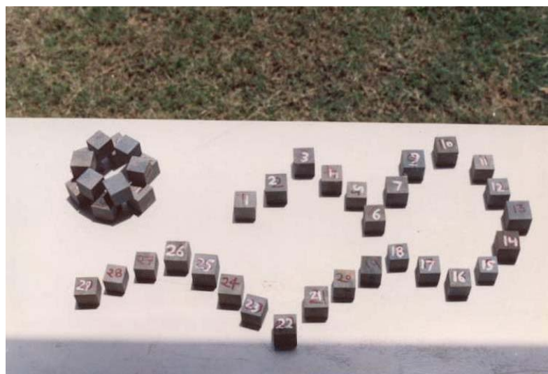
Fig. 2: Rock cubes preparation for measurement of uniaxial compressive strength (JCS)

before testing (Fig.2). Care was taken to have final smooth finishes towards the ends of specimens to 0.05 mm by using different meshes. Samples were kept in water under low pressure vacuum conditions for a period of two weeks.