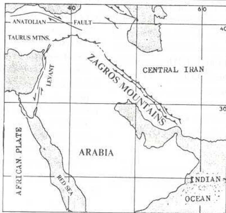
Fig 3. Location of Zagros mountain ranges in the western part of Iran and the major tectonic elements of the region.

indicate that these two features have more or less similar trends in their anomalies. The subparallelism between the Red Sea and the Zagros Crush Zone could be interpreted as subparallelism between the Red Sea rift and the supposed rift located in the place of the present Zagros Thrust fault. This phenomenon may be merely a coincidence which has just happened to occur in the way that shows a nearly parallel feature, but it may also be interpreted as a similarity in the origin between these two features. In other words it may indicate that the causative mechanism that has produced the opening of the Red Sea during 42 to 35 m.y. ago was similar to that responsible for opening the Zagros rift which is supposed to start opening sometimes in the Early Carboniferous time. The possibility of the movement in the cause of rifting which may be