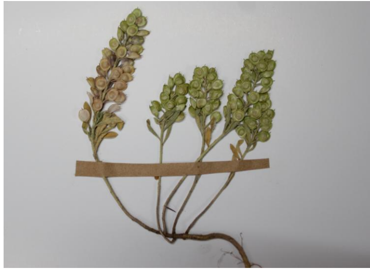
Fig. 1. Plant on sheet of Herbarium ( A. mazandaranicum ).