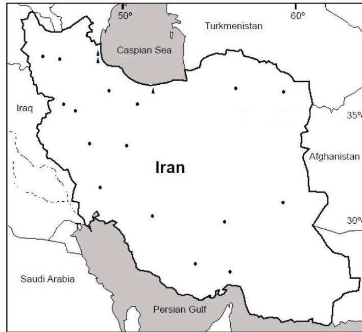
Fig. 3. Distribution of Alyssum szowitsianum (●) and A. mazandaranicum (▲) in Iran.