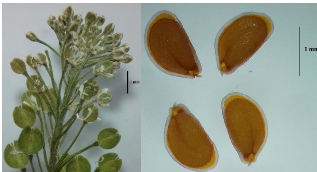
Fig. 3. Inflorescence (left) and seeds (right) of Lepidium virginicum .