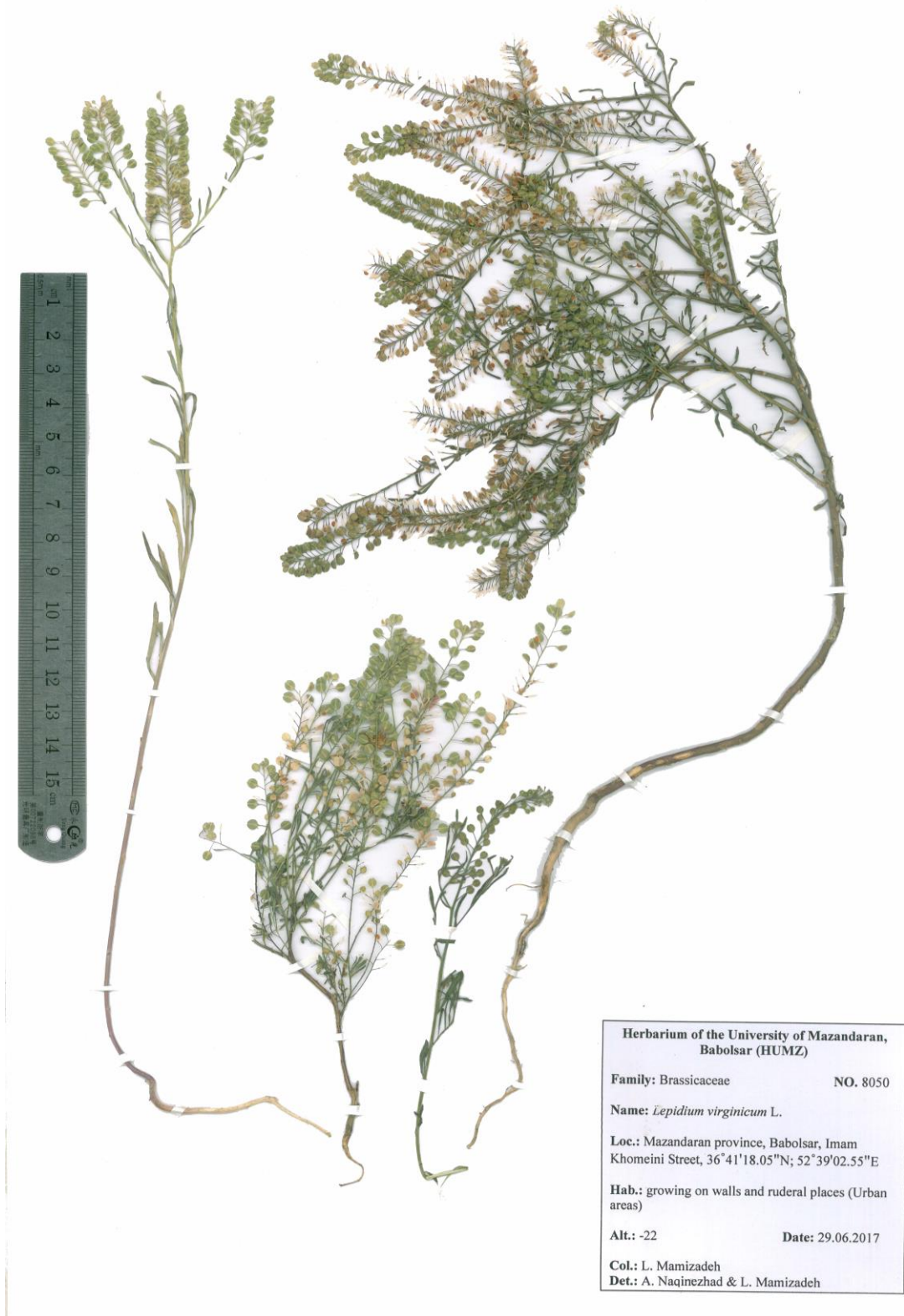
Fig. 1. Lepidium virginicum .