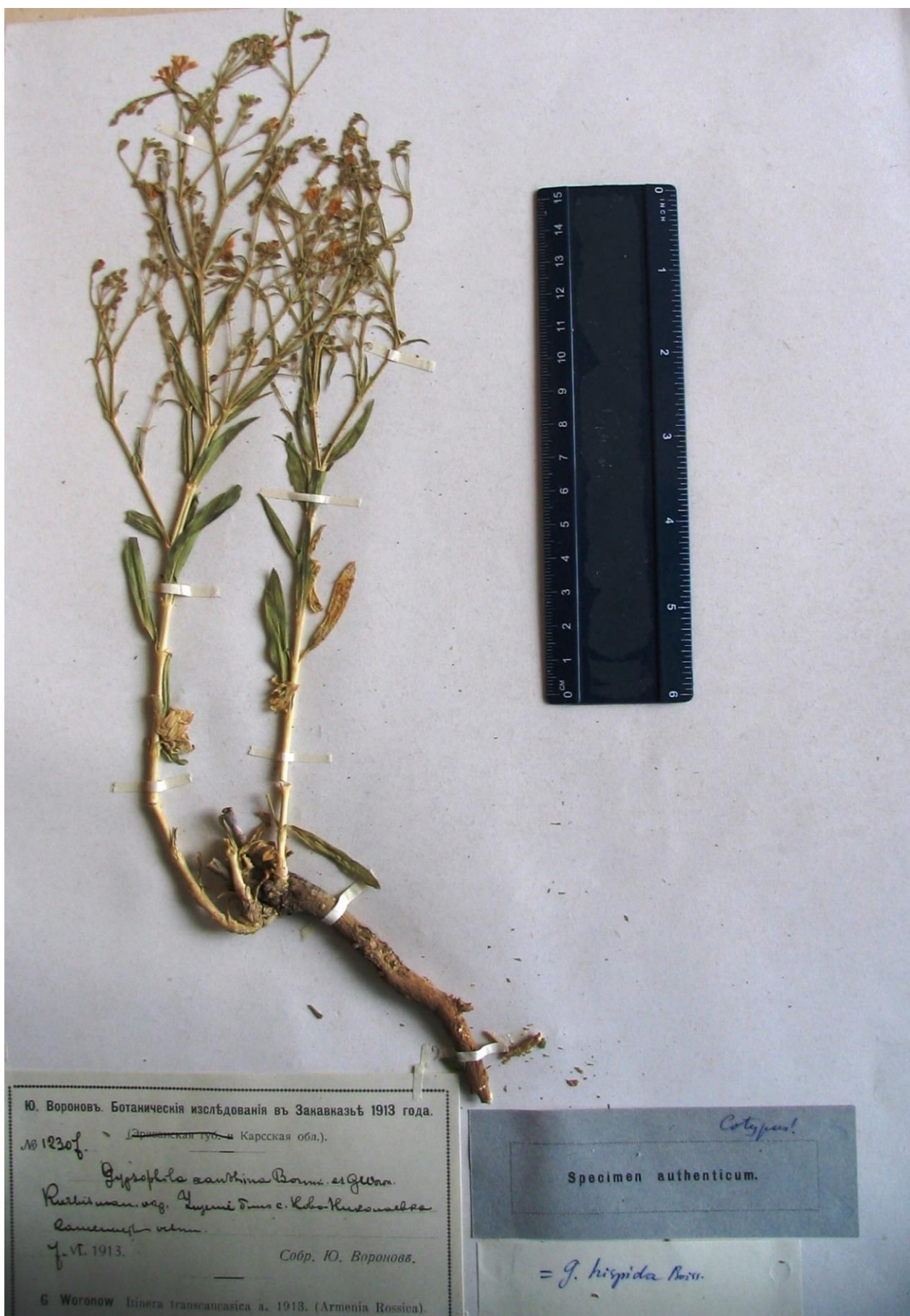
Fig. 2. Syntype of Gypsophila xanthina (Woronow 12307, LE!).