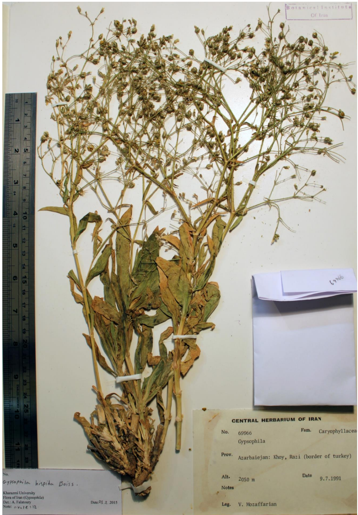
Fig. 1. Gypsophila hispida (V. Mozaffarian 69966, TARI!).