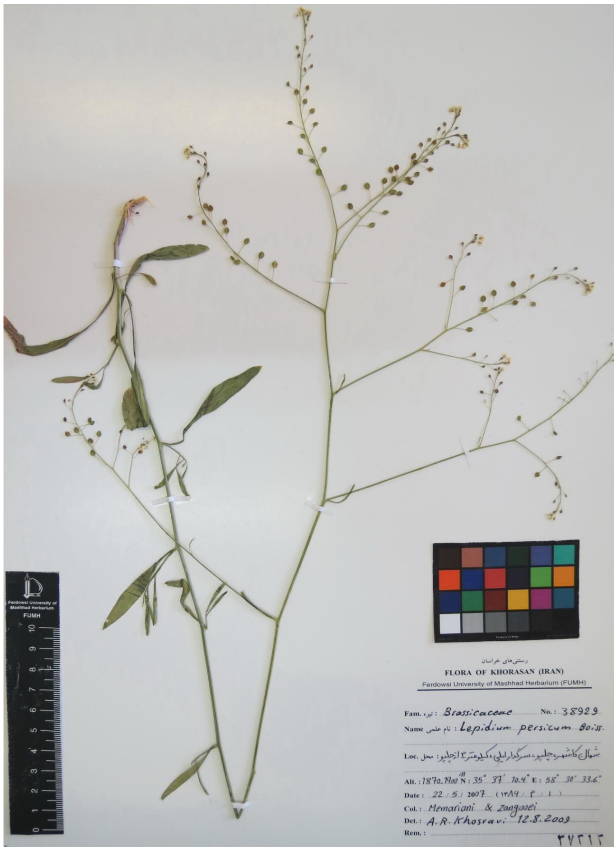
Fig. 1. Lepidium ferganense Korsh.; Memariani & Zangooei 38929 (FUMH).