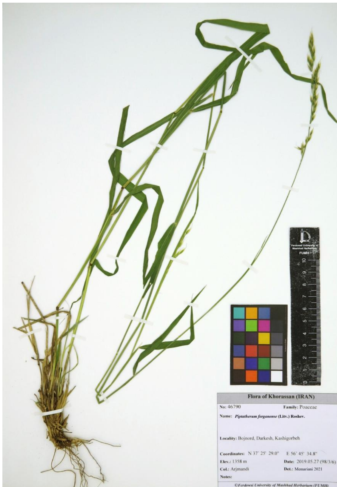
Figure 1. Herbarium specimen of Piptatherum ferganense (Arjmandi 46790-FUMH).