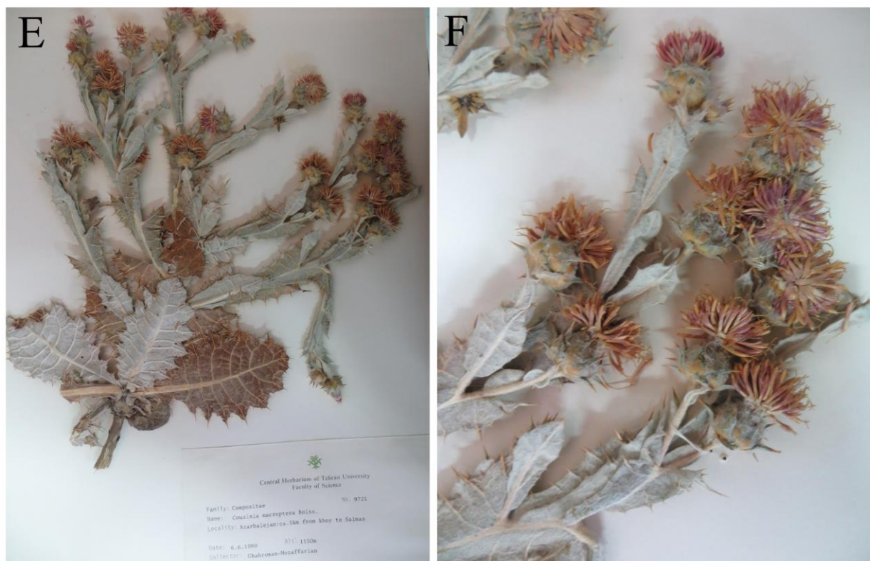
Fig. 2. E-F: Photos of Cousinia macroptera .