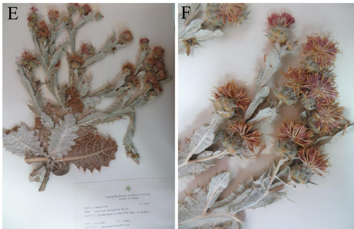
Fig. 2. E-F: Photos of Cousinia macroptera .