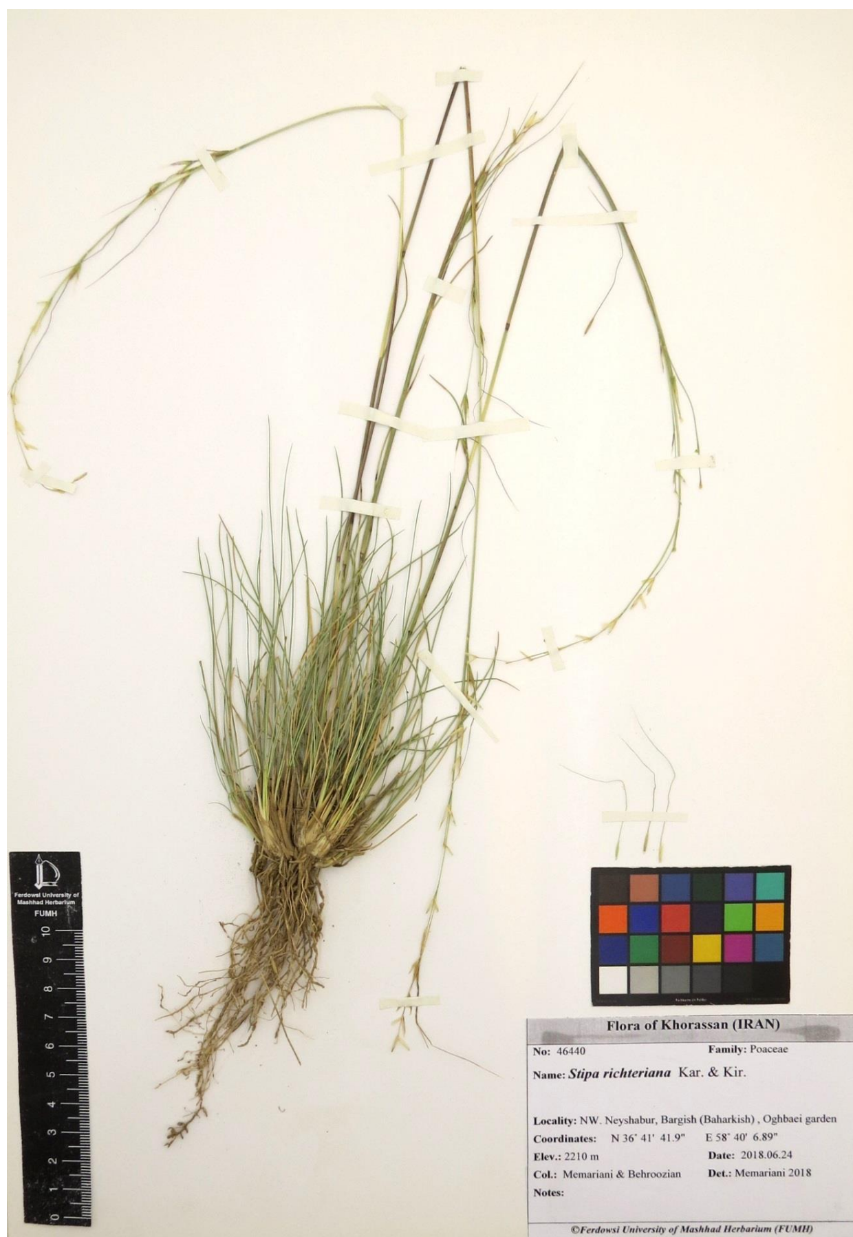
Fig. 1. Herbarium specimen of Stipa richteriana (Memariani & Behroozian 46440, FUMH).