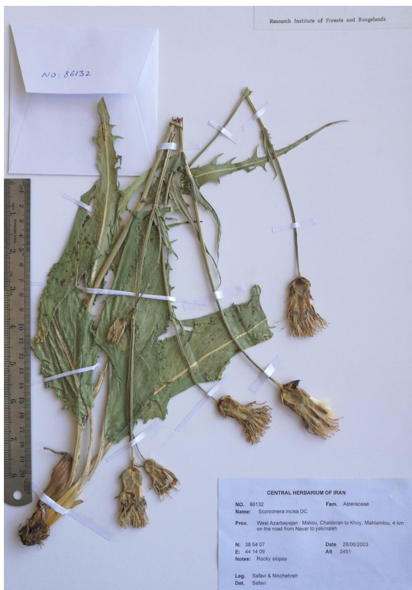
Fig.1. Scorzonera incisa DC. (Safavi & Nikchehreh 86132, TARI).

collected from West Azarbayejan Province in NW Iran and deposited in TARI by the author. After a thorough determination of the specimens, a new record of Scorzonera from Iran was recognized. The new record was compared with a large number of specimens belonging to the Scorzonera species deposited in the herbaria of TARI and the Iranian Research Institute of Plant Protection (IRAN); it was also compared with the published descriptions of Scorzonera species in the flora of Iran and neighboring countries (Chamberlain, 1975; Lipschits, 1964; Rechinger, 1955, 1977; Safavi et al. 2013). After a careful consideration, it was concluded that the specimen was a new record for the flora of Iran, belonging to the Scorzonera incisa DC.