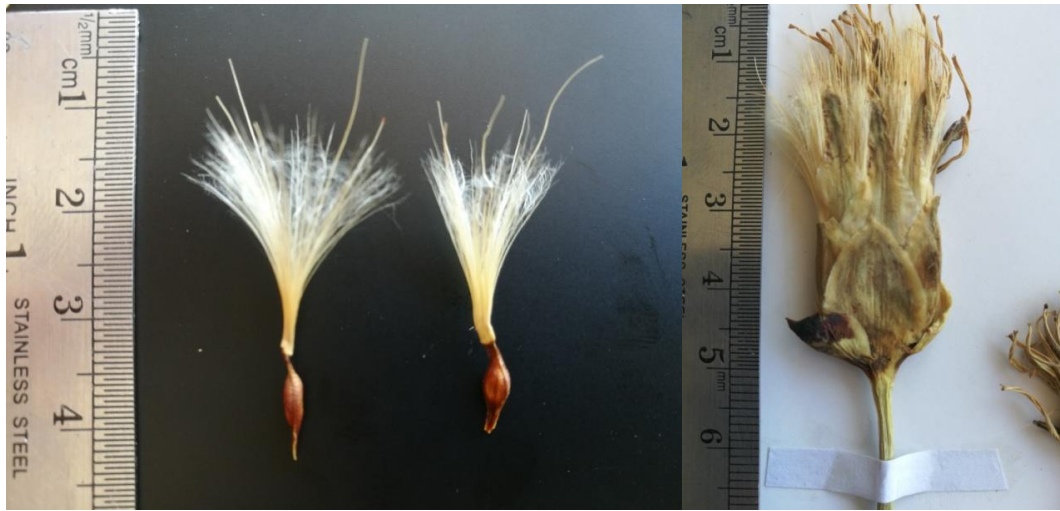
Fig. 2. Scorzonera incisa DC. Achene & Capitule, (Safavi & Nikchehreh 86132, TARI)