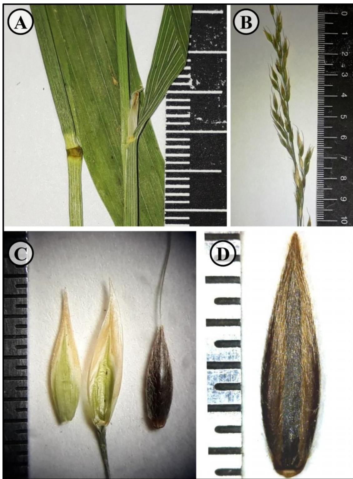
Figure 2. A-D: Some details of morphological characters in Piptatherum ferganense (Arjmandi 46790-FUMH); A: the leaf sheaths showing the long ligule (ca. 7 mm), culm node, and the wide leaf blade (ca. 10 mm); B: the lanceolate panicle with evenly furnished spikelets; C: the acuminate glumes and the anthercium with hairy lanceolate lemma and a slightly curved awn; D: a ventral view of the anthercium.